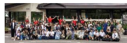
Photo entries submitted by high school photography clubs and circles from across the country were selected through a process of work and presentation evaluation. In 2024, a record 604 schools participated. CP+ will exhibit works by 18 schools that advanced to the finals from 11 blocks across Japan. Visitors will enjoy the showcase of creativity and